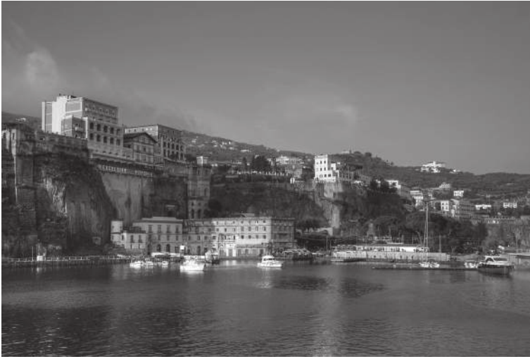
Fig. 1 for Question 1